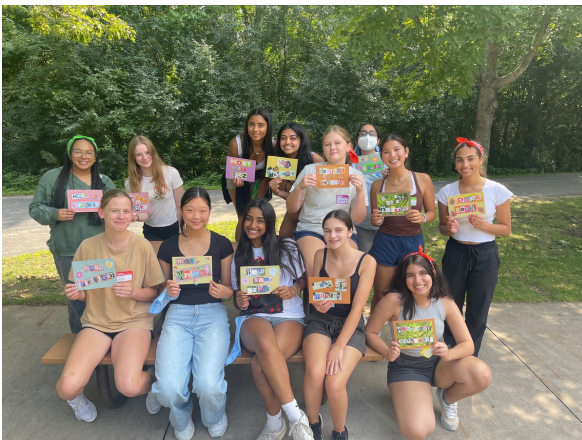
YAB at Fall Retreat