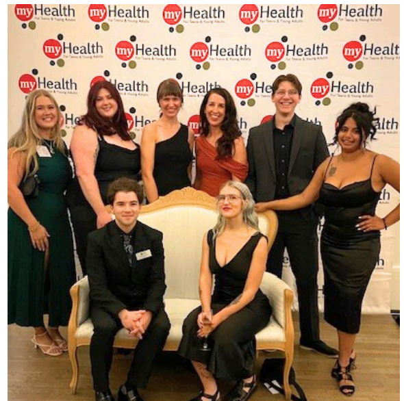
myHealth Education Team hosted the 2024 Mirror Ball Gala