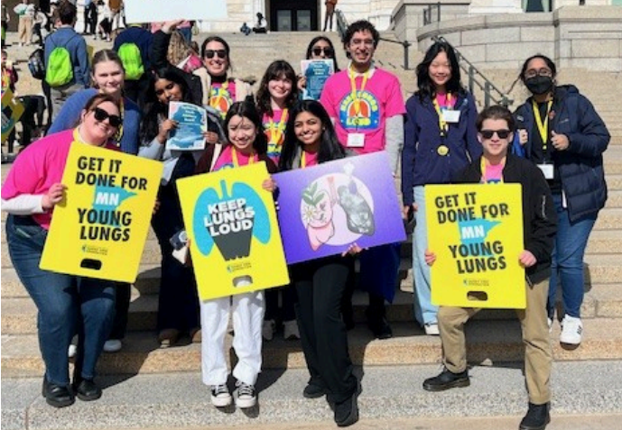
Staff and YAB at Smoke Free Generation's Day at Capitol in February 2024.