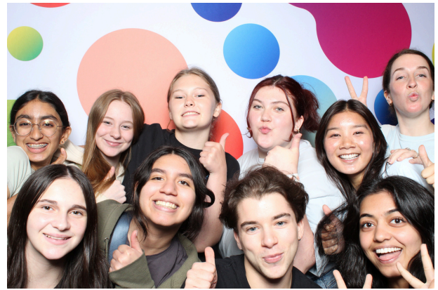
Staff and YAB MDH's Youth Summit in June 2024.